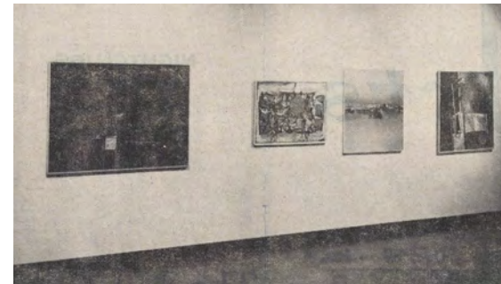
Installation view: Ten Contemporary Painters from India, University of South Florida, Tampa, 1963–64. Gaitonde's work appears third from the left.