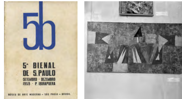
Exhibition catalogue cover (left) and installation view (right): São Paulo Biennial, Museu de Arte Moderna de São Paulo, September 21–December 31, 1959.