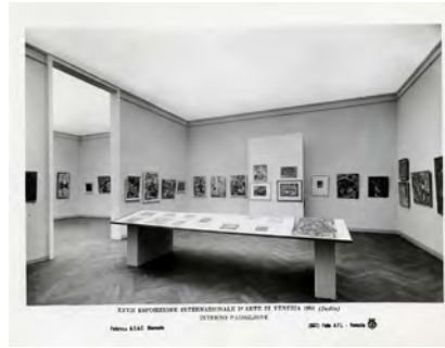
Installation view: Venice Biennale, June 19–October 17, 1954.