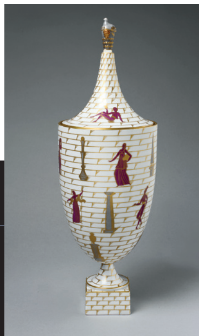
Gio (Giovanni) Ponti, An Archaeological Stroll ( La passeggiata archaeologica ) urn with cover, 1925. Manufactured by Richard Ginori, Doccia, Italy. Porcelain, 50.2 cm high. The Metropolitan Museum of Art, New York, Purchase, Edward C. Moore Jr. Gift, 1931.