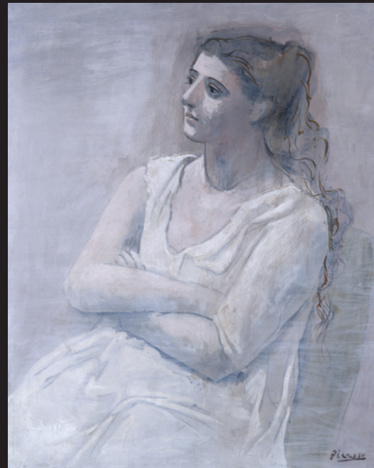
Pablo Picasso, Woman in White ( Femme assise, les bras croisés ), 1923. Oil, water-based paint, and crayon on canvas, 99.1 x 80 cm. The Metropolitan Museum of Art, New York, Rogers Fund, 1951; acquired from the Museum of Modern Art, Lillie P. Bliss Collection.

“Picasso’s Woman in White ( Femme assise, les bras croisés , 1923) is a masterpiece of his Neoclassical period, which lasted from 1918 to 1925. Here, the artist depicts a seated figure as a dreamlike vision of fragile perfection and refinement. He achieves this effect through the application of several layers of white wash and superimposed contours in soft shades of brown and gray. As in many of his other figures of the period, the idealized treatment of her facial features reflects Picasso’s study of classical art.” 3 Self-possessed and with an expression that combines resolve and concern, she is the incarnation of this approach. 4