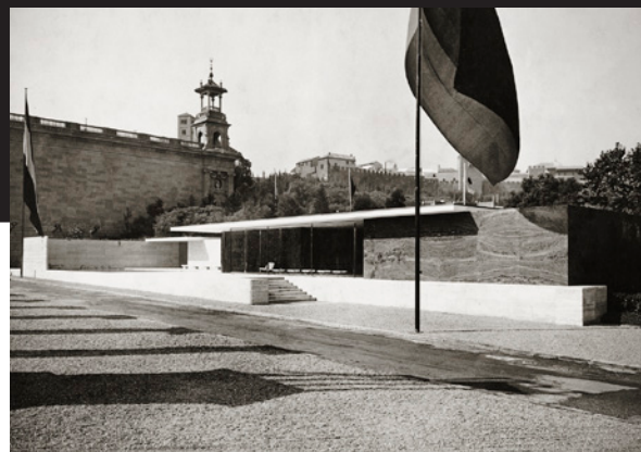
Ludwig Mies van der Rohe, Barcelona Pavilion, 1928–29. Exterior view from front, 1929. Gelatin silver print, 16.5 x 22.2 cm. The Museum of Modern Art, New York, Mies van der Rohe Archive, gift of the architect. Installation view: Exposición internacional (International Exposition), 1929

When the exposition closed in 1930, the building was disassembled but not forgotten. As time went by, it became important not only in Mies's career but also in 20th-century architecture as a whole. In 1983, the Fundació Mies van der Rohe was founded with the express purpose of rebuilding the pavilion. The reconstruction adhered to the original characteristics and materials as closely as possible. Completed in 1986, it stands on the original site and is open to the public.