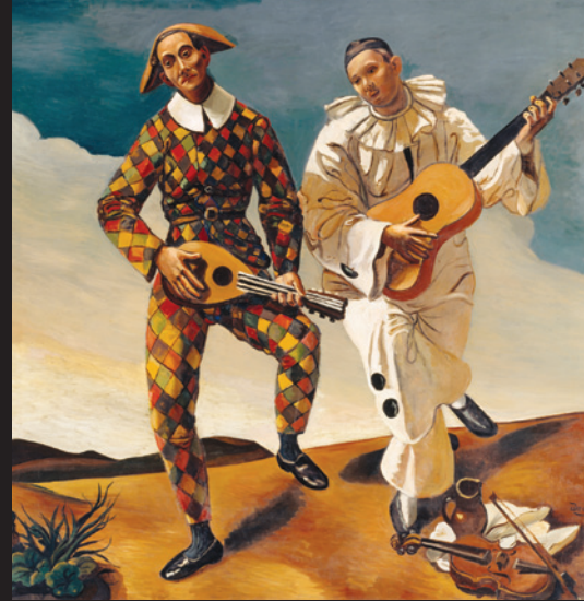
André Derain, Harlequin and Pierrot ( Arlequin et Pierrot ), 1924. Oil on canvas, 175 x 175 cm. Musée de l'Orangerie, Paris. © 2010 Artists Rights Society (ARS), New York/ADAGP, Paris.

“Self-consciously artistic, picturesque, and typological,” the Italian Comedy was suitable for modern artists because of its folk conventions and lack of naturalism. “Commedia dell'arte offered much more for postwar artists than familiarity alone. As a genre both venerable and contemporary, it fulfilled the idea of modern classicism at the same time that it provided an alternative story line to the ancient myths that so powerfully gripped postwar European culture. A Latinate family of man, the commedia dell'arte represented normalcy in a period taken with the idea of common sense and anxious to cast off prewar emotionalism: ‘No Othello, no Hamlet, no Phèdre or Chimera, no one who agitates his mind with overpowering emotions,’ wrote scholar Pierre Louis Duchartre, ‘the commedia dell'arte is a complete world where each can find his nourishment.’” 24