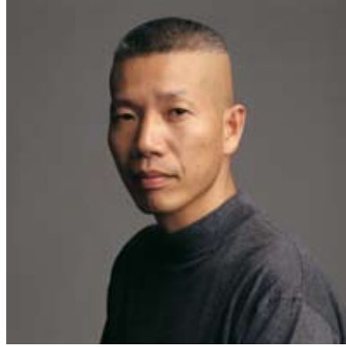
Cai Guo-Qiang