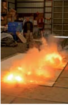
Cai Guo-Qiang creating gunpowder drawing Bird of Light (2004) at Fireworks by Gucci, Brookhaven, New York, 2004