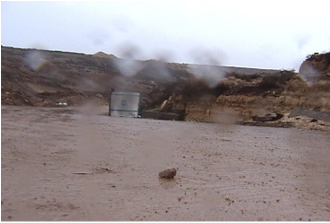
Emily Jacir Crossing Surda (a record of going to and from work), 2002

Two-channel color video installation with monitor and projection, with sound, 132 min. and wall text, dimensions variable