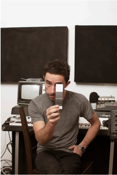
The Cinematic Orchestra