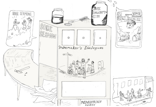
Futurefarmers Sketch 2, 2011 Ink on paper, 20 x 25 cm © Futurefarmers.