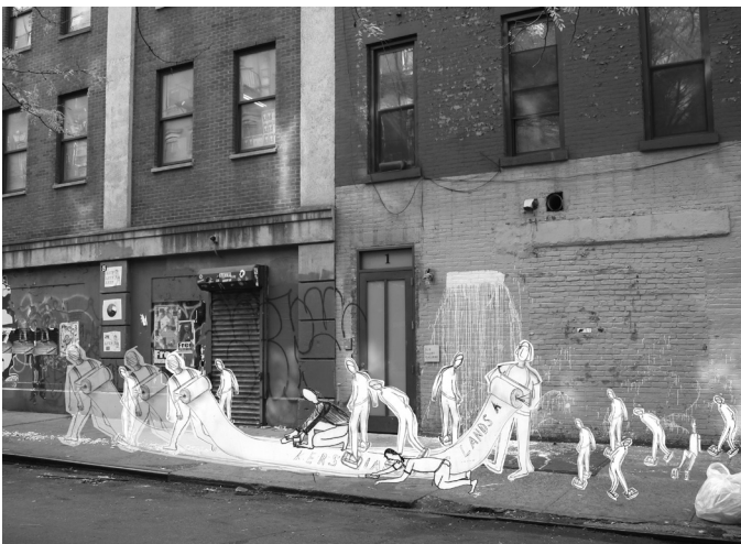
Futurefarmers Untitled, 2010 Sketch for the action Pedestrian Press (2011) Inkjet print, 25 x 20 cm