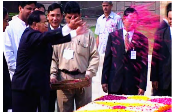
Amar Kanwar The Face , 2005 (from The Torn First Pages , 2004–08) Color video, with sound, 4 min., 40 sec., looped Courtesy the artist and Marian Goodman Gallery, New York/Paris © Amar Kanwar