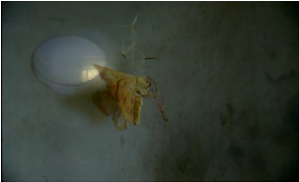
Desire Machine Collective (Sonal Jain and Mriganka Madhukaillya) Residue , 2011 35mm film, with sound, 39 min., looped Courtesy the artists © Desire Machine Collective