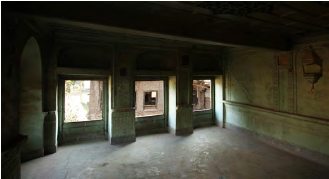
Desire Machine Collective (Sonal Jain and Mriganka Madhukaillya) Nishan , 2007- Four-channel digital color video installation, with sound, running time TBD, looped Dimensions vary with installation